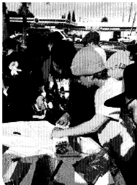
Parking Lot Skate Jam attendees construct mini-skate ramps donated by Keen Ramps Warehouse LB in January 2020

builds with community organizations such as Power4Youth, Safe Refuge, Mental Health America, and Action Sports Kids Foundation.