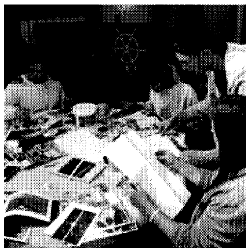
Community members create a 'zine' at the Parking Lot Skate Jam in November 2019

Workshops have been a key element of each event hosted by Rose Park Neighborhood Association, Long Beach Skate Co., and Revive Church. Although our nation and the world are rethinking how 'we meet up' we want to highlight the connectedness that can and needs to be accomplished, most notably "The Parking Lot & Skate Jam" event, which brings in over 50 kids from our community. These events feature skateboarding obstacles, theme focused art workshops, FREE food and live music. All events have been held in the parking lot of Revive Church on 7th and Obispo.